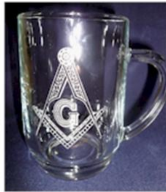
Lead Crystal Firing Glass Large Crystal Mancunian Tankard

Table Lodge Glassware $25.00 (Firing Glass) & $20.00 (Tankard) or both for $40.00